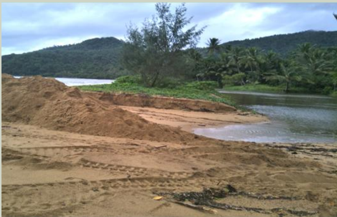
27 th April 2021 excavation