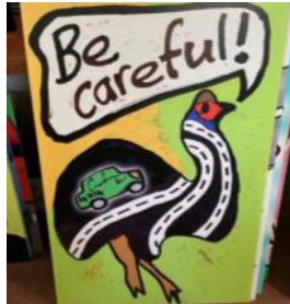
Shearwater/cassowary children's conservation messages