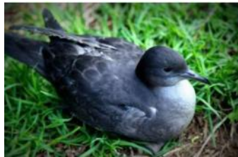
Shearwaters on Bunurong/ Boonwurrung Country Cassowaries on Djiru Country