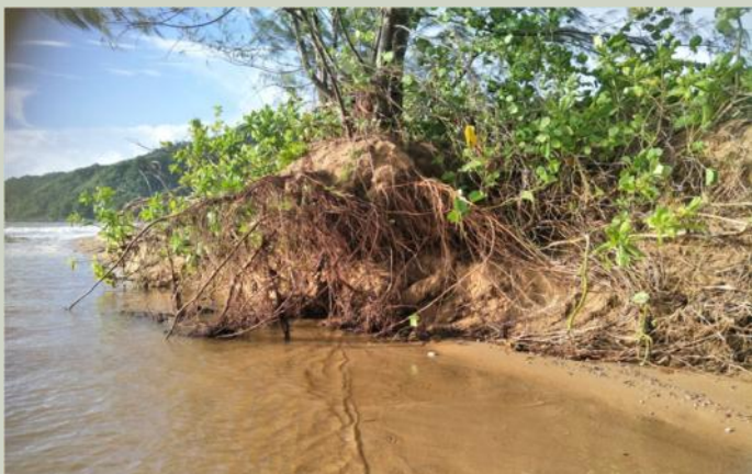
Jan 2022 Severe erosion of dune vegetation