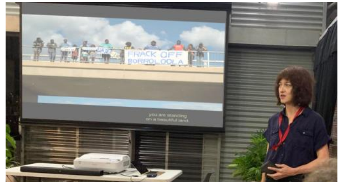
Rachael O'Reilly introduces 'Infractions' at Mission Arts

The film platforms important First Nation voices between Yallarm (Gladstone, Queensland)—where unconventional gas was first approved in Australia—and current struggles against shale gas fracking that threatens 51 per