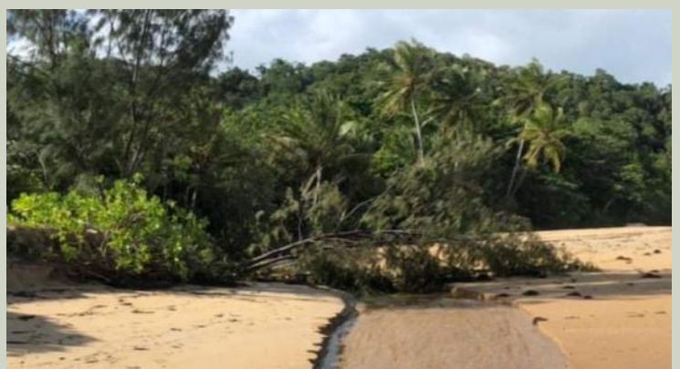
22 Jan 2022 Collapse of the she-oak tree.