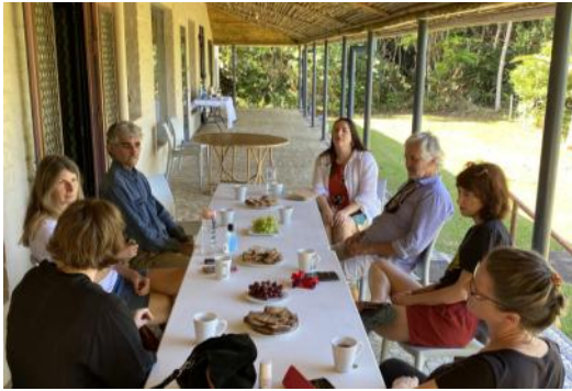
Workshop at Ninney Rise

In June, on the coldest day of the year we welcomed guests from JCU and University of Queensland Museum of Art (UQMoA) to discuss future projects at Ninney Rise.