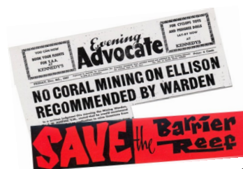
1967 Innisfail newspaper and original campaign sticker

The anniversary will be celebrated with two events.