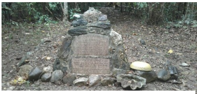
Banfield graves, Dunk Island

The councillors were very interested and impressed by Ninney Rise.