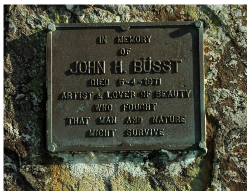
John Busst Memorial Plaque, Bingil Bay

We hope that they will both attend an inspection of the Banfield Graves on Dunk Island when we will be urging the Council to restore the walking track and low bridge on the Council easement from the National Park to the Grave Reserve (which we manage) allowing tourists and locals to visit the Historic Graves.